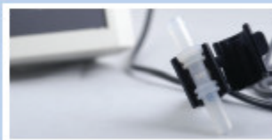
Medisch & farmacie