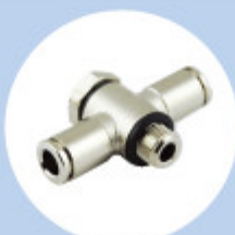
Fittingen & toebehoren